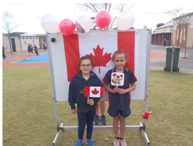
Kadina students celebrated Canada Day in July last term.