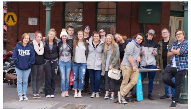
At Queen Victoria Markets