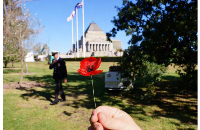
A KMS student's photo at the Sunday Shrine of Remembrance Service.