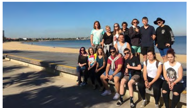
St Kilda beach