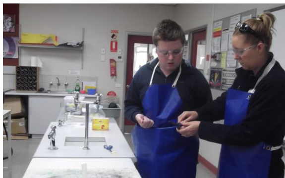
Unit's Senior class investigate 'chemical reactions'.