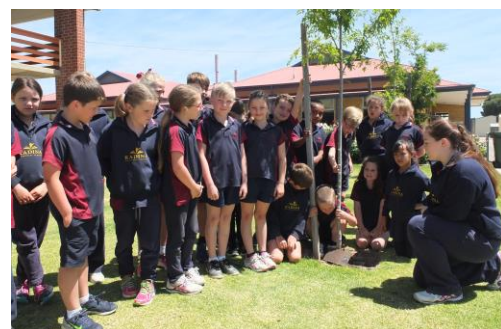
Above, explaining our 'Memorial' heritage.