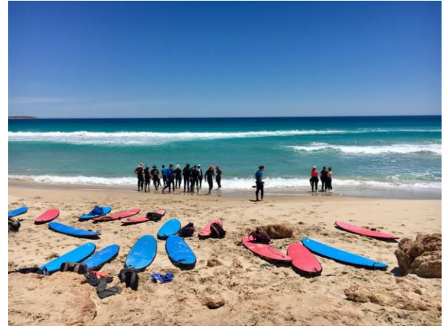
Amazing summer weather has provided the perfect conditions for both the Year 7 Aquatics camps and the annual Surf camp.

It has been a fun, physically exhausting and challenging week enjoyed by all.