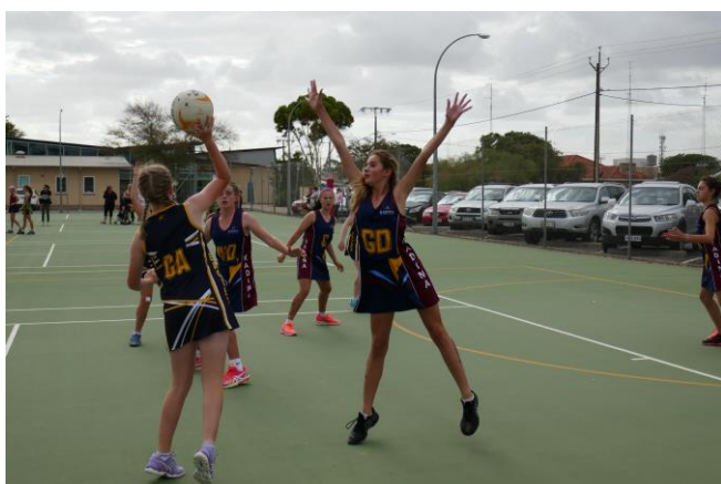
Above, KMS1 team was undefeated during the competition.