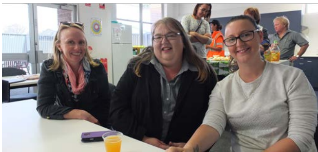
A Canadian Halloween!