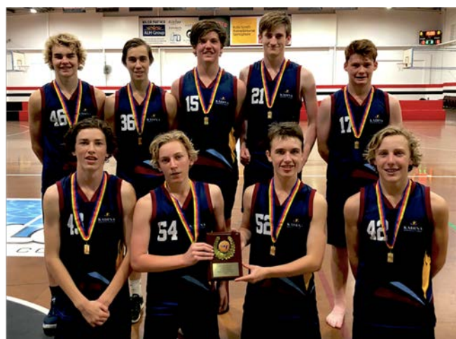
Above, State Knock Out Basketball Champions.