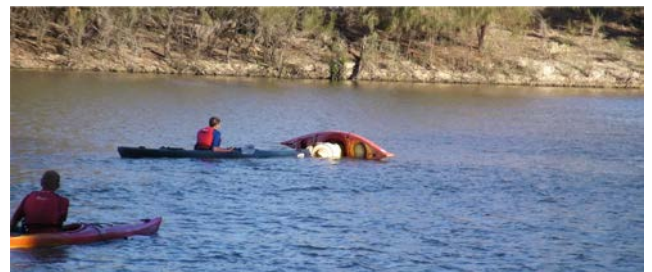
Practising rescue drills