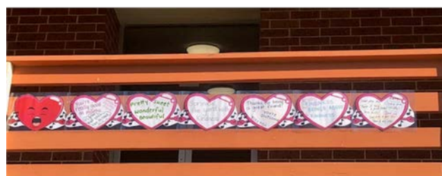
Above, positive messages were displayed from the Senior School balcony.