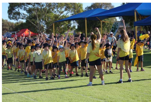
Southwood won the march and chant on Day One at the R-6 Sports Day.