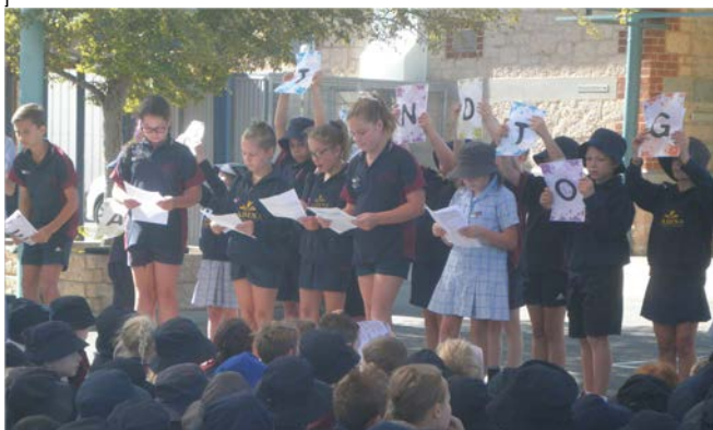
Above, students collected letters from safe places to reveal a message at assembly 'Take a stand together, Bullying No Way 2019'.