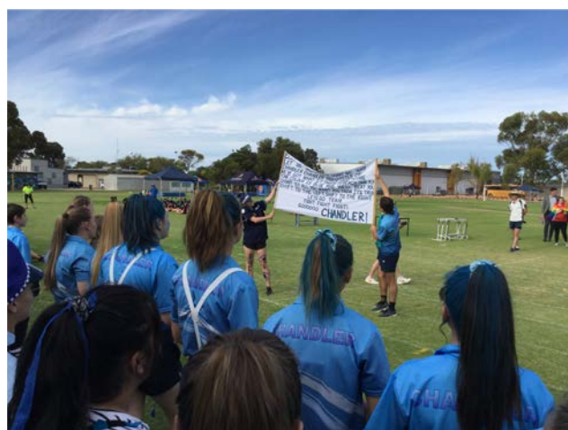
Chandler started the 7-12 day out in force, winning the march and chant.