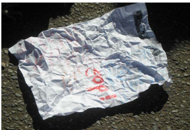
Above, a crumpled piece of paper with the folds showing the scars left from hurtful messages.

Bullying No Way Day 2019 was a day of reflection and acceptance for all students and staff at KMS. We watched two videos about the words we can use to empower others. Then in groups we brainstormed words we would use in the phrase 'Keep calm and...What words would you use?' We also had the choice of writing a positive comment on the back of our note. The notes provided a positive perspective on the words we use daily. When looking at these positive messages it constantly reminds you to keep your cool and re-evaluate your values. Even though Bullying No Way day has come to an end we should all make more of an effort in the way we treat others, both in the school environment and at home.