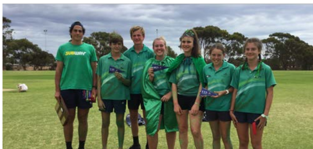
Heath won the U13, U15 and Open pennants.

Age group pennant winners were presented on Sports Day, with Heath dominating in 2019.