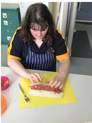
Above, students during their lessons.