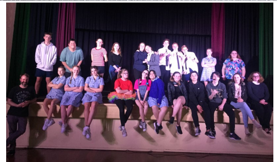
Above, the 'Between These Lines' production.

We are looking forward to presenting high quality performances in the new Performing Arts Centre from late next year.