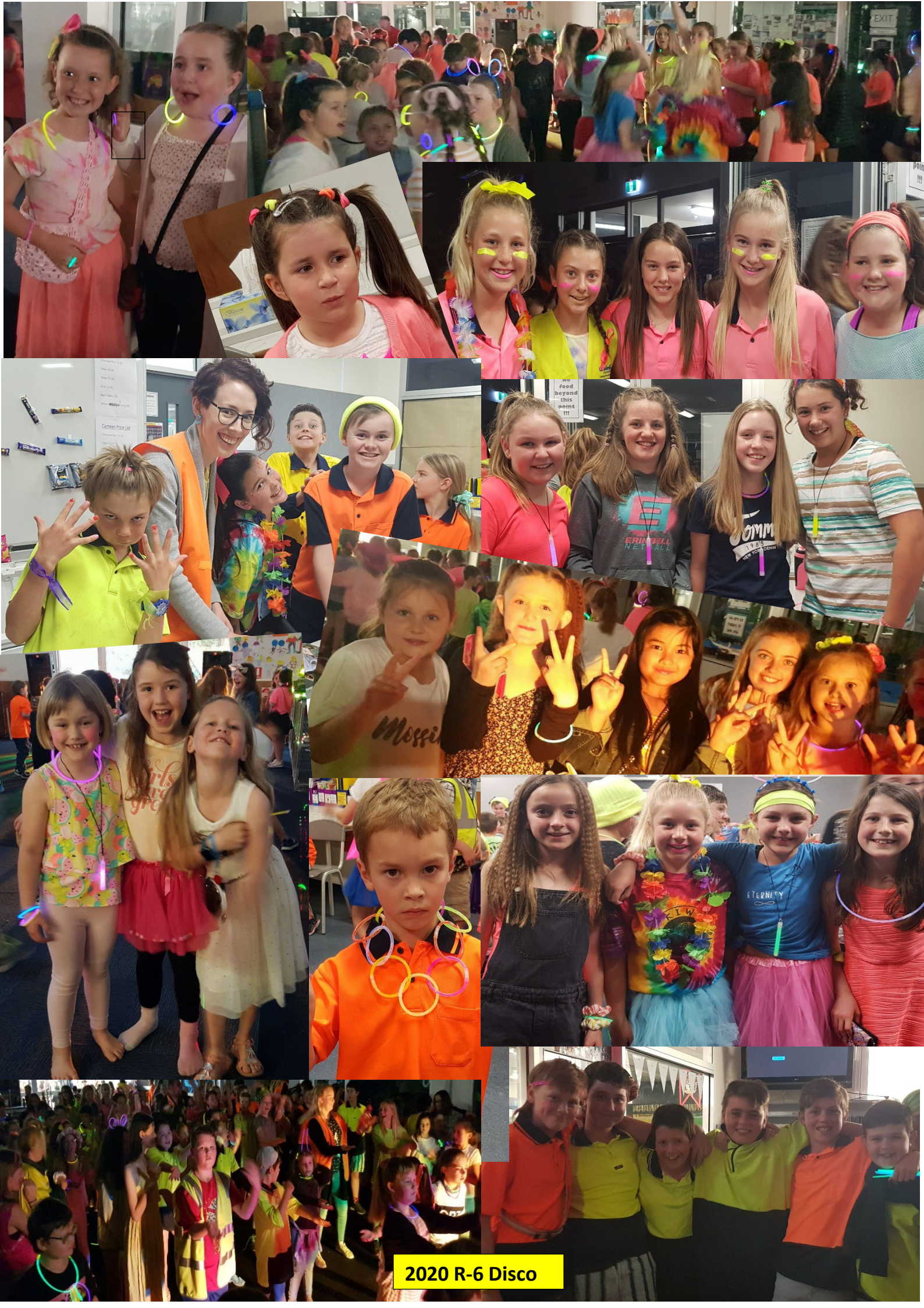
2020 R-6 Disco