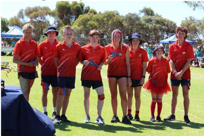
A sign of the future? Rose won the Under 13, Under 14 and Under 16 Age Group Pennant.