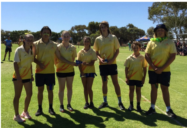
Southwood won the Under 15 Pennant Age Group.