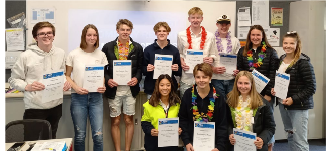
Above, Best Company Report winner Moana Cruises