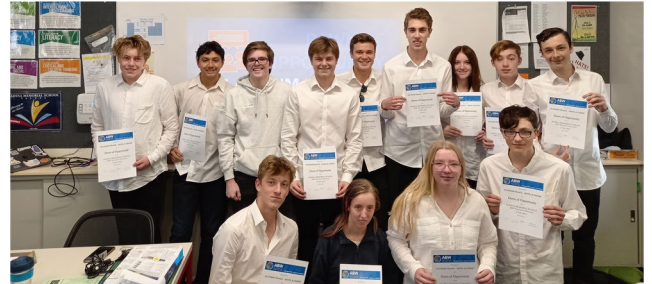
Above, Dawn of Opportunity winner Platinum Palace