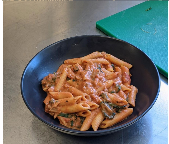
Above, wraps, fried rice and pasta prepared by year 10 students to celebrate their Semester 1 learning.