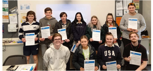
Above, Grand Champion awarded to Hillcrest Country Club