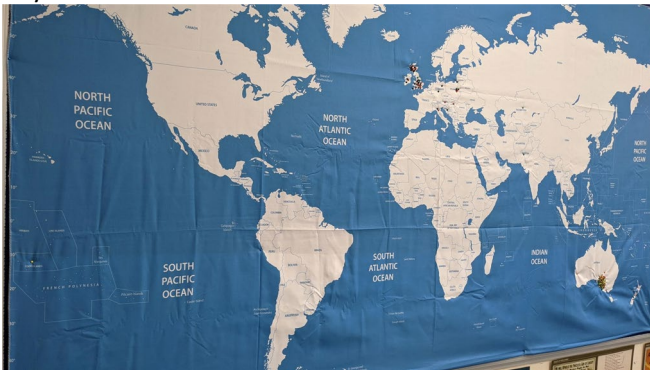
Above a world map where students pinned their ancestors place of origin.