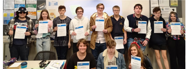
Above Most Eco-Friendly winner Time Jump Hotel