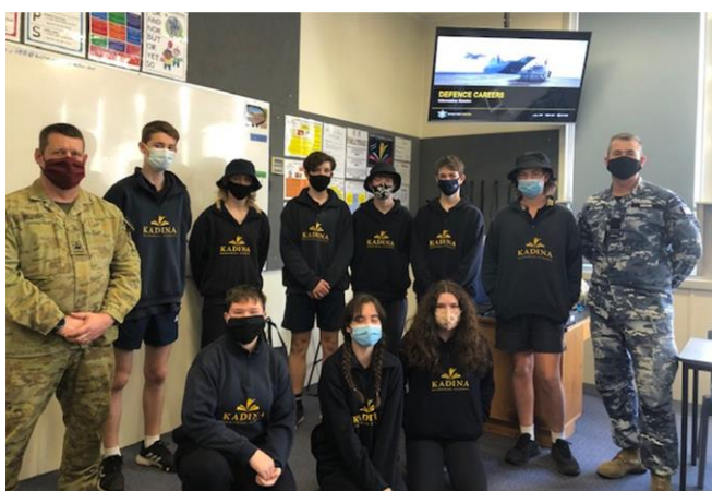
Australian Defence Force personnel met with interested Middle and Senior school students about study and career opportunities in the armed forces recently.