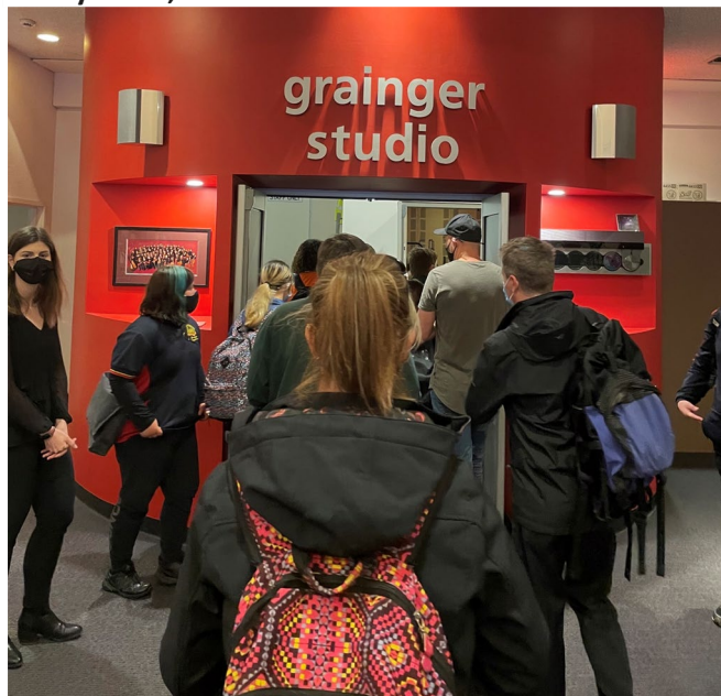
Above, students go into the Grainger Studio to watch their collaborative work performed by the ASO.