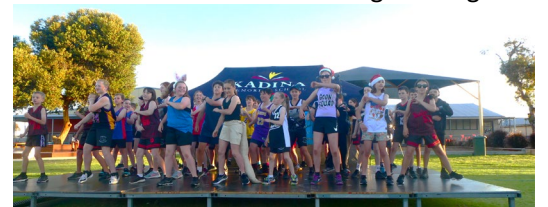
Above, year 6 students perform their final dance, which resulted in the whole R-6 cohort joining in from the sidelines.

A big thank you to families who worked with students and teachers to provide the creative costumes. It was an entertaining evening.