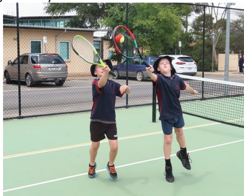
Year 4 Hot Shots tennis players in action!