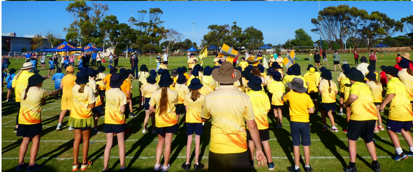
Southwood continued its winning Health Hustle and Chant performance on both days.