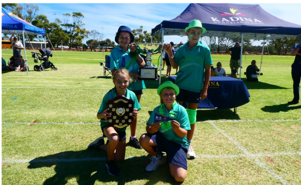
R-6 Heath Captains hold the winning cup on Thursday.