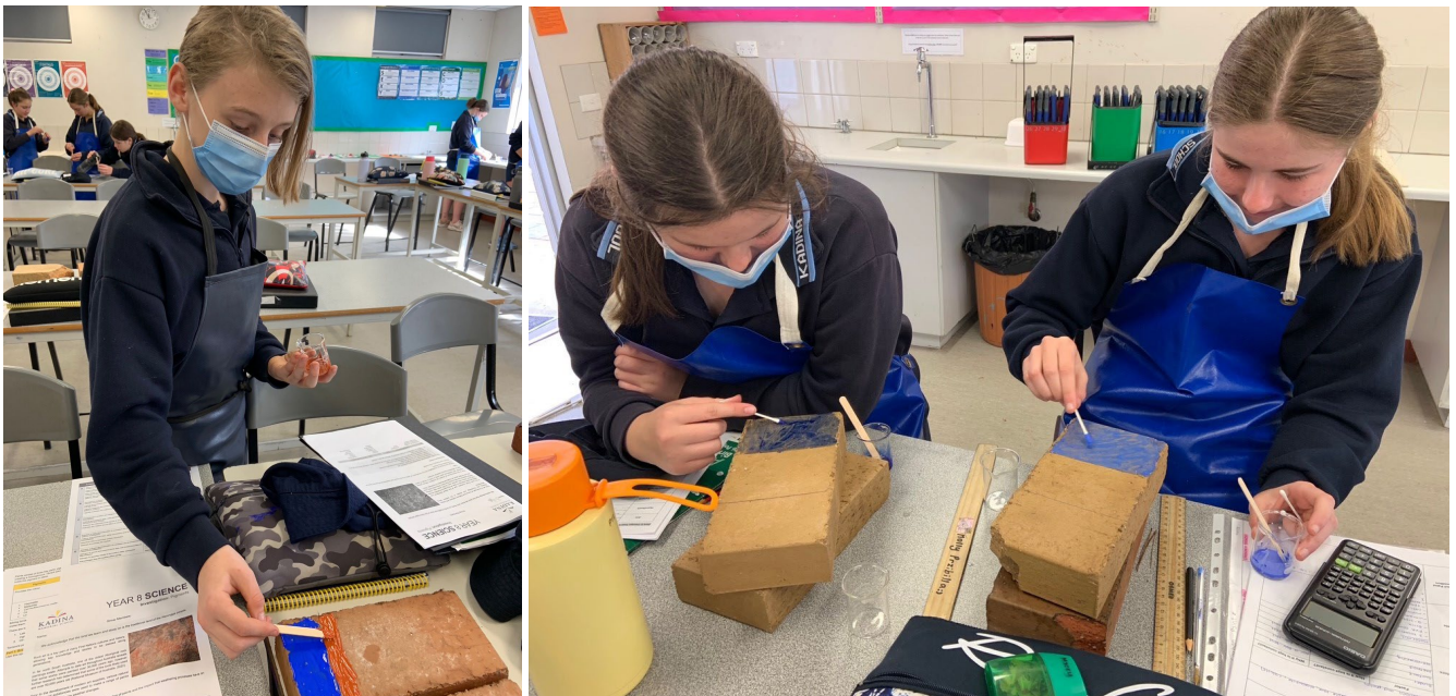
Above, year 8 science students undertake an investigation into traditional pigments.