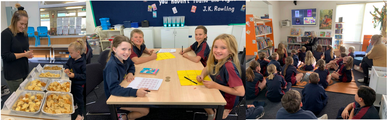
Above, taste testing foods, exploring games and stories during library lessons.