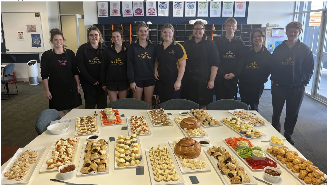
Stage 1 Food & Hospitality task required students to research and prepare a morning tea using native ingredients.