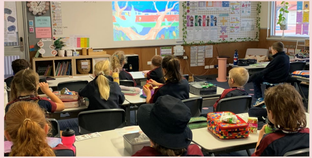
R-6 students enjoy the story 'Family Tree' during NSS.