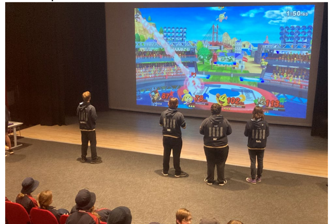
Above, students in action!