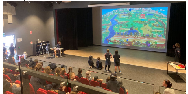
Spectators enjoyed the competition by cheering on their friends and year levels.