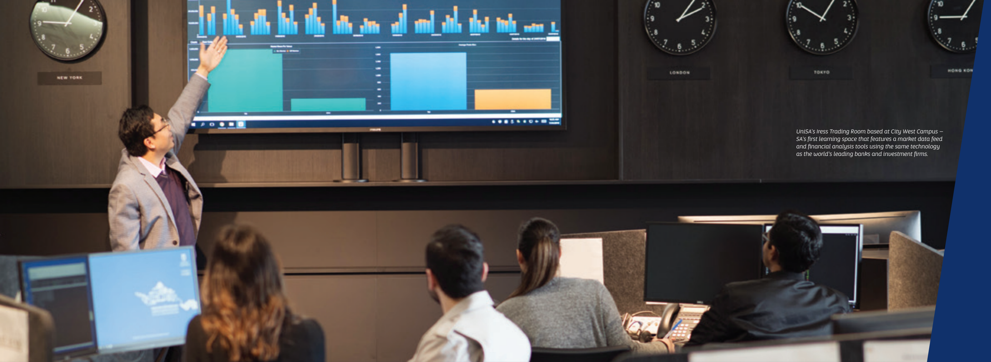
UniSA's Iress Trading Room based at City West Campus – SA's first learning space that features a market data feed and financial analysis tools using the same technology as the world's leading banks and investment firms.