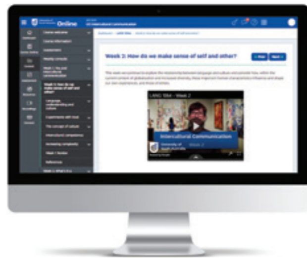
UniSA Online's custom learning platform – access it anytime, anywhere.