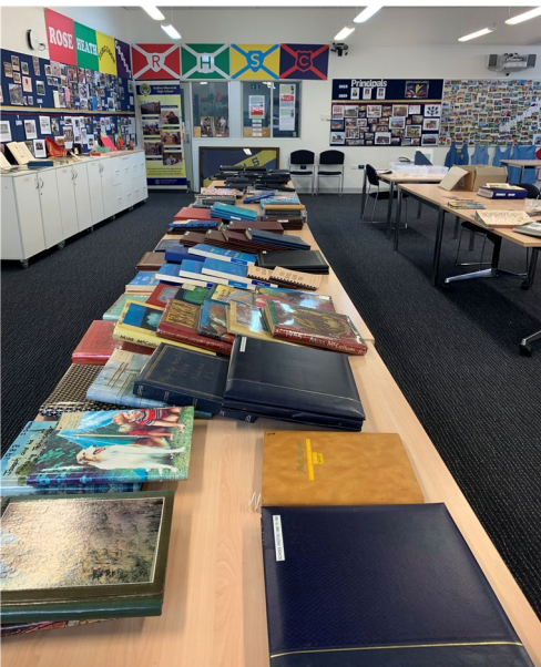
Above, the Anniversary library historical display.