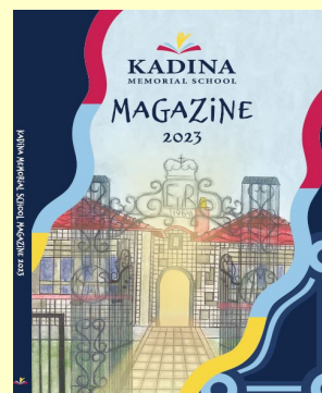
KADINA MEMORIAL SCHOOL ABN: 36 006 836 570

Online payments: BSB: 105 004, KMS A/c Number: 051004640, Reference: Family Code